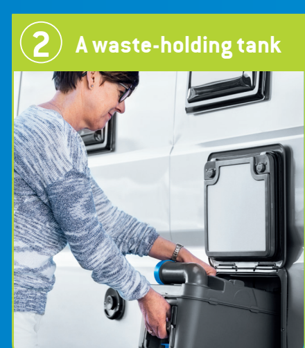
Outside the recreational vehicle you find access to the removable Cassette or so called waste-holding tank.

A: No. Normal household cleaners may cause permanent damage to seals and other toilet components. Therefore Thetford has a wide range of specially developed toilet care products.