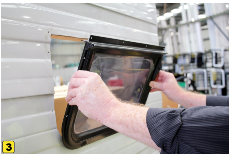
Fill cladding seams with silicone then crush final 10mm. Position window in opening on the wall of the van where it is going to be permanently installed. Do this from the outside of the van. Bottom of the window to go in first - to clear thumb locks.