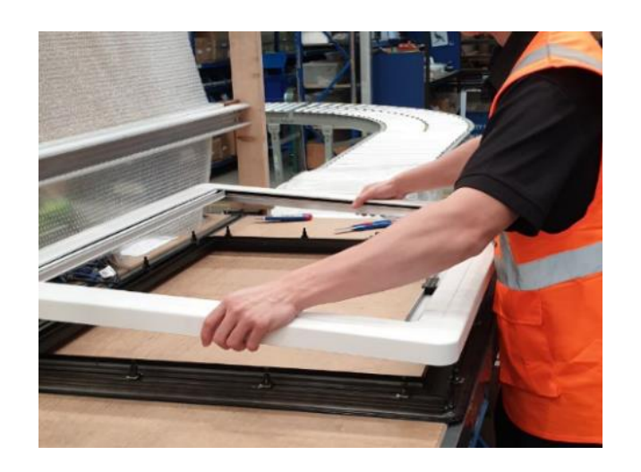
6. Apply moderate pressure to the internal frame marrying the clips together securely to the internal frame.