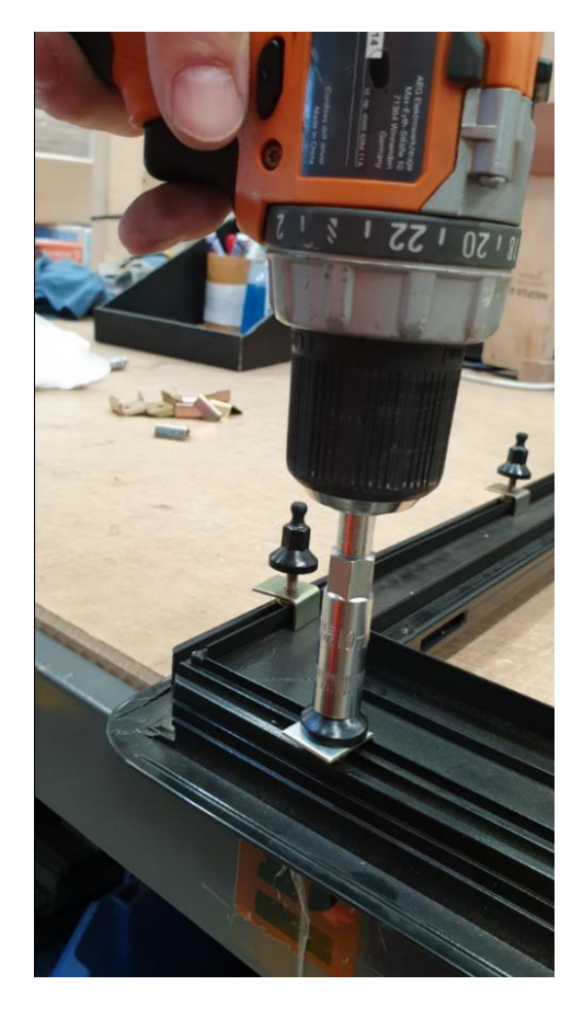
4. Fit new pawn clips at the recommended torque at 1.5Nm. A visual check to ensure the L shape bracket is at 90\0000 angle.