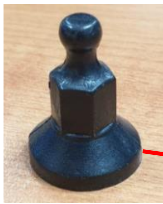
New fitting clip (pawn clip)