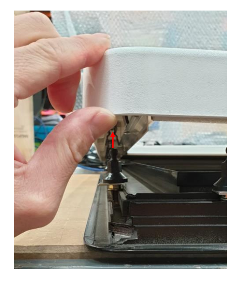
5. Ensure that all pawn clips is align with the internal frame clip-in counter part.